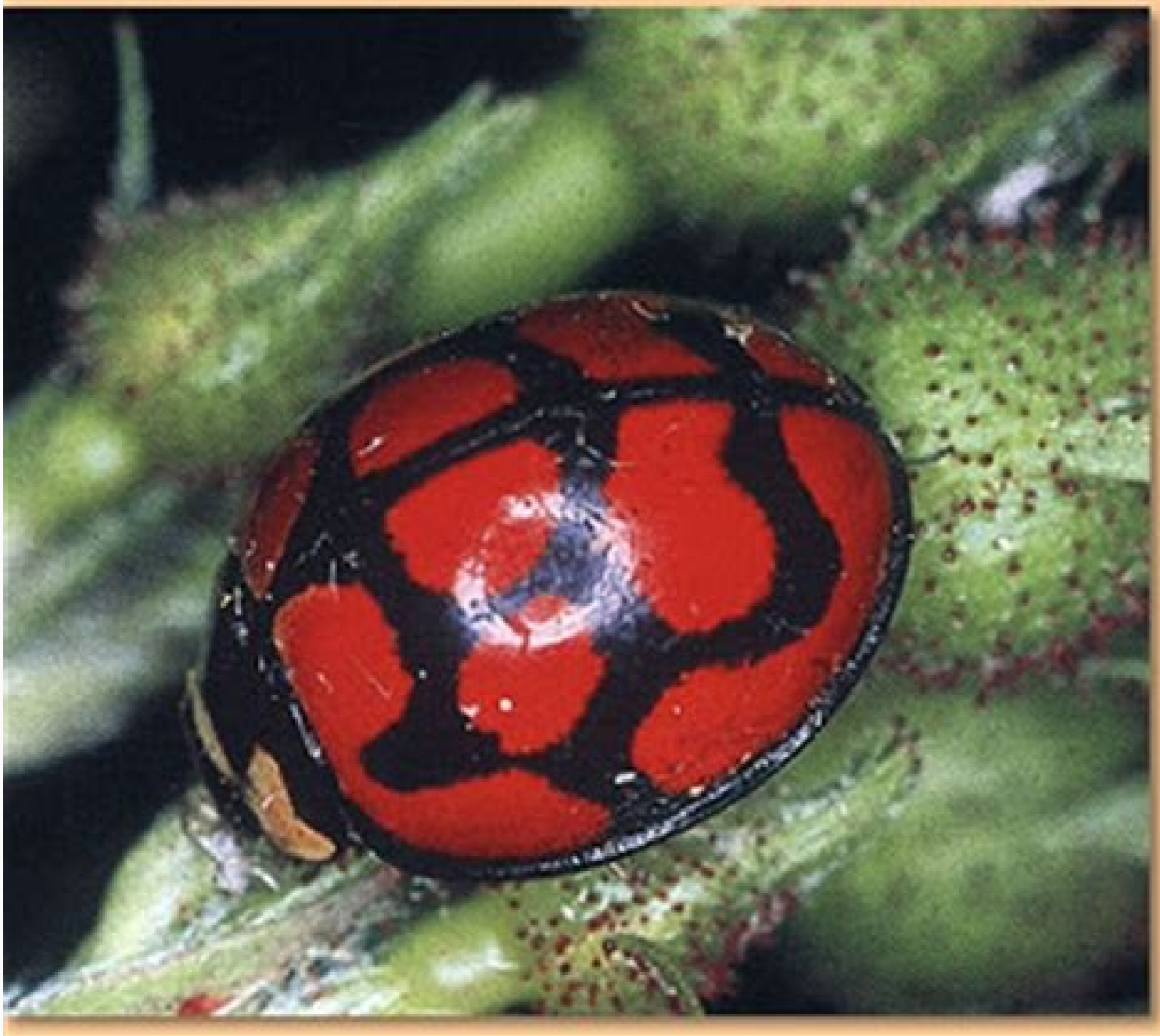
Field guide to insects of south africa pdf. Field guide to insects of south africa.