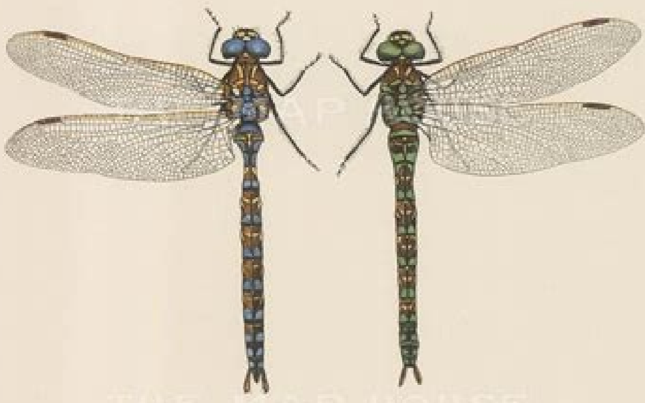
THE MAP MOUSE